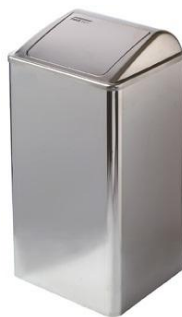
PP0065C / PP0080C