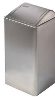
PP0065CS / PP0080CS