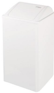
PP0065 / PP0080